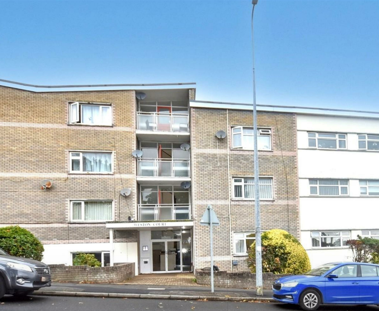
3, Weston Court Barry, CF63 4JD